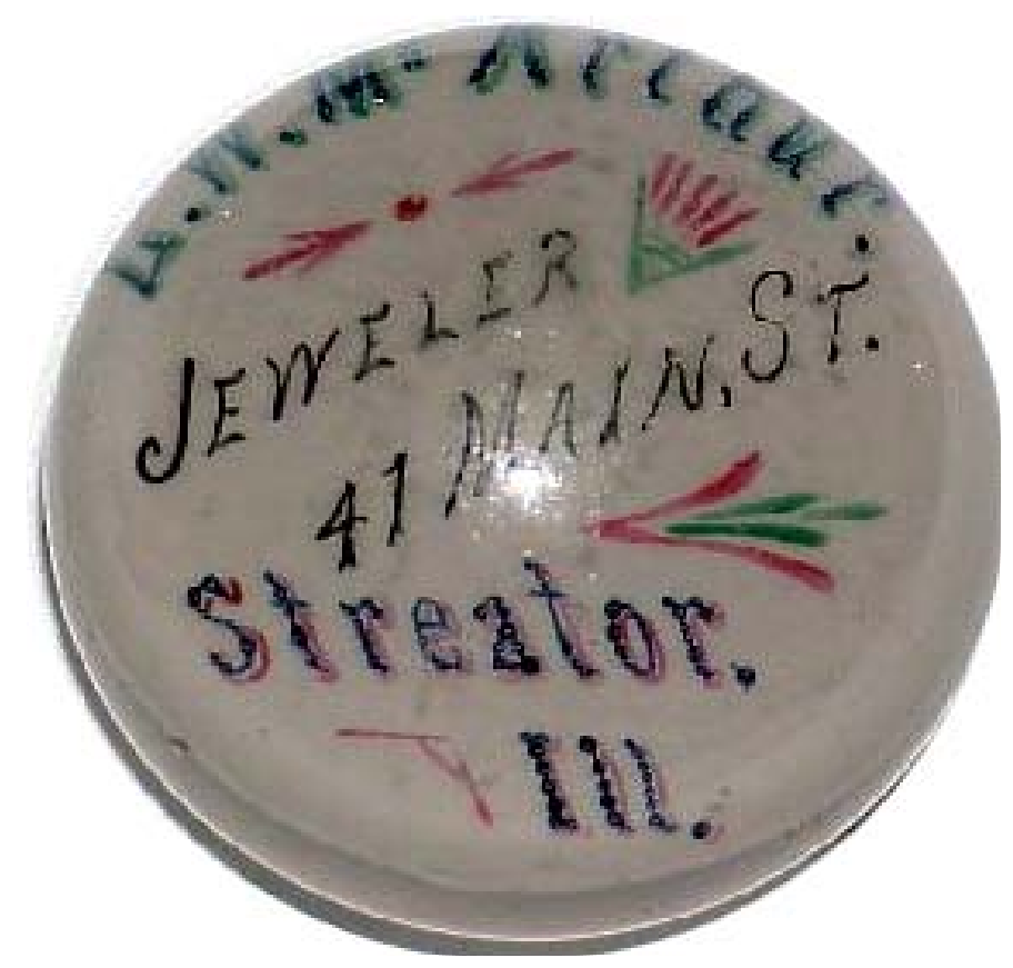
Figure 3. Jeweler Advertising Paperweight