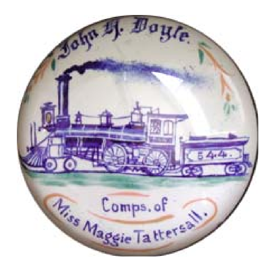
Figure 10. Rail Road Paperweight (Sweetheart's Gift)