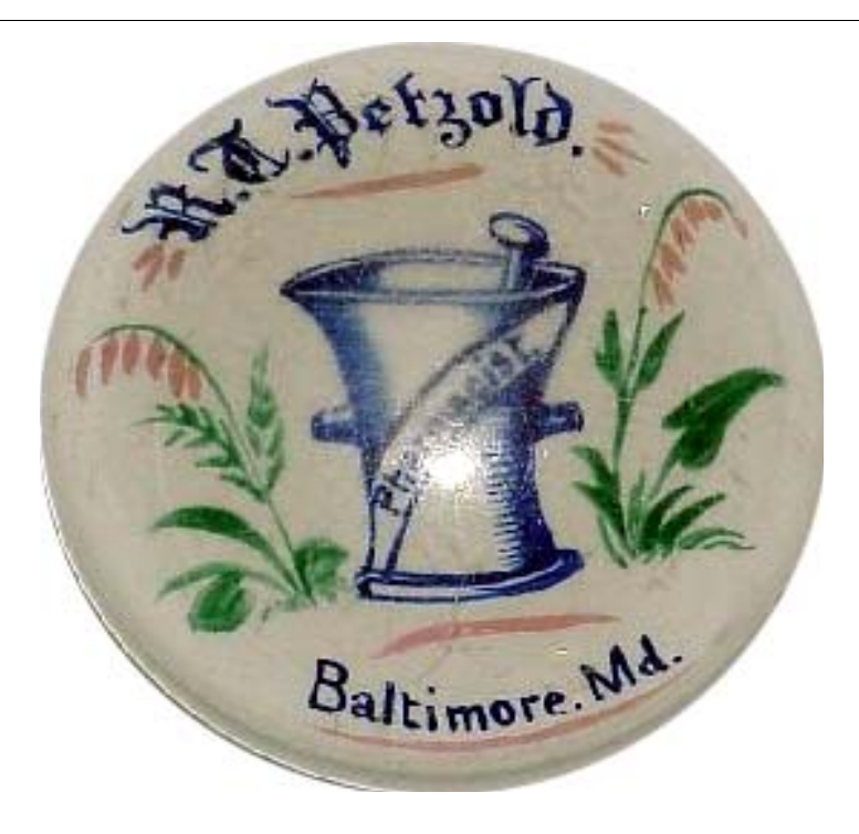
Figure 5. Pharmacist Paperweight