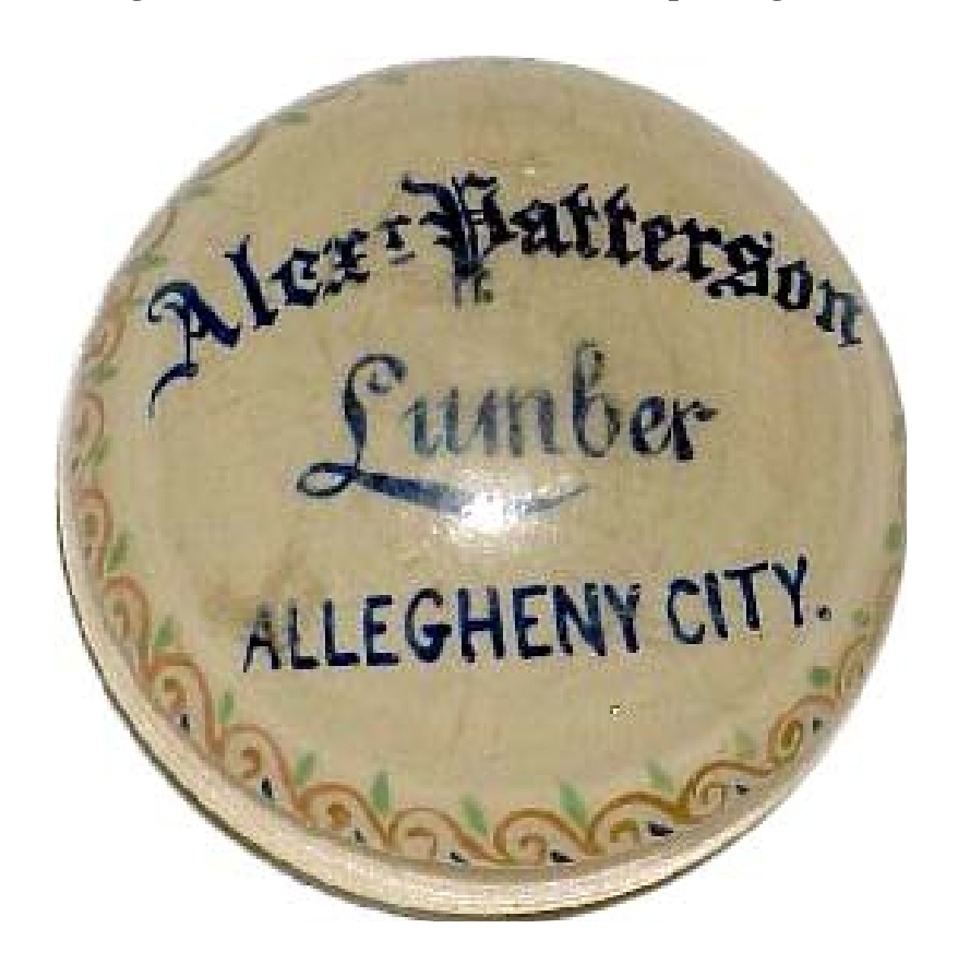
Figure 2. Patterson Lumber Paperweight