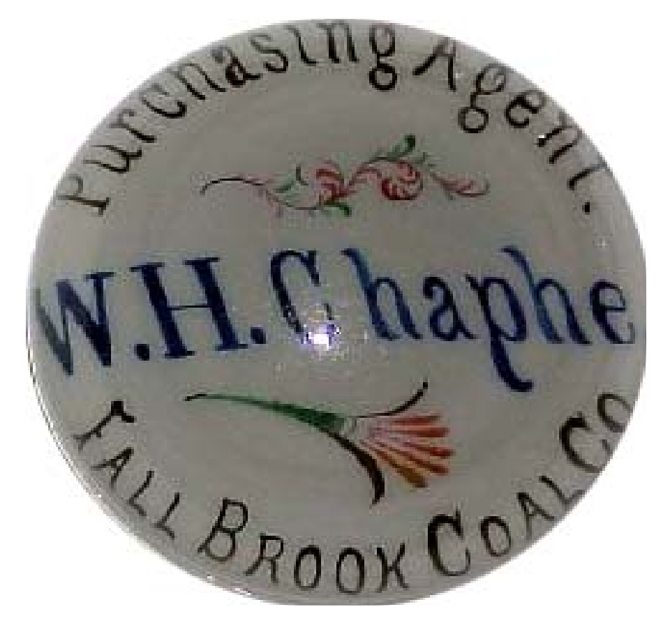
Figure 4. Purchasing Agent Paperweight