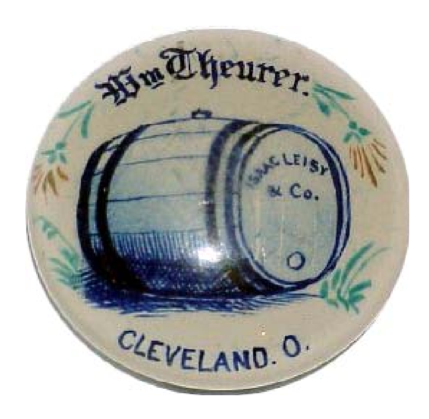
Figure 6. Advertising Paperweight