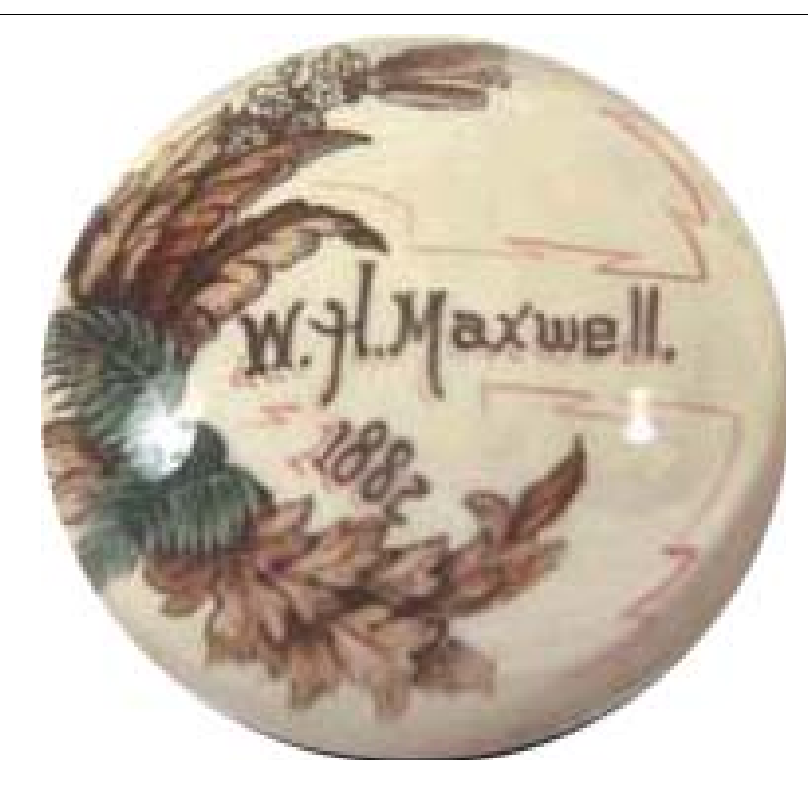
Figure 7. Maxwell Paperweight