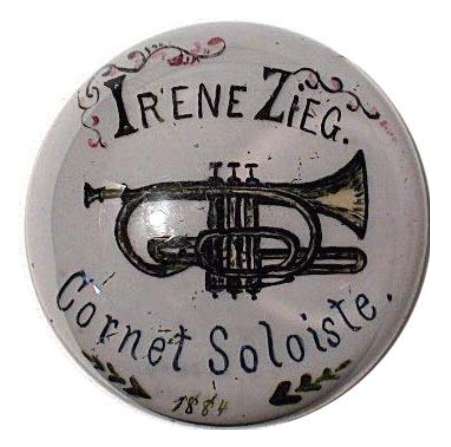
Figure 8. Cornet Soloiste