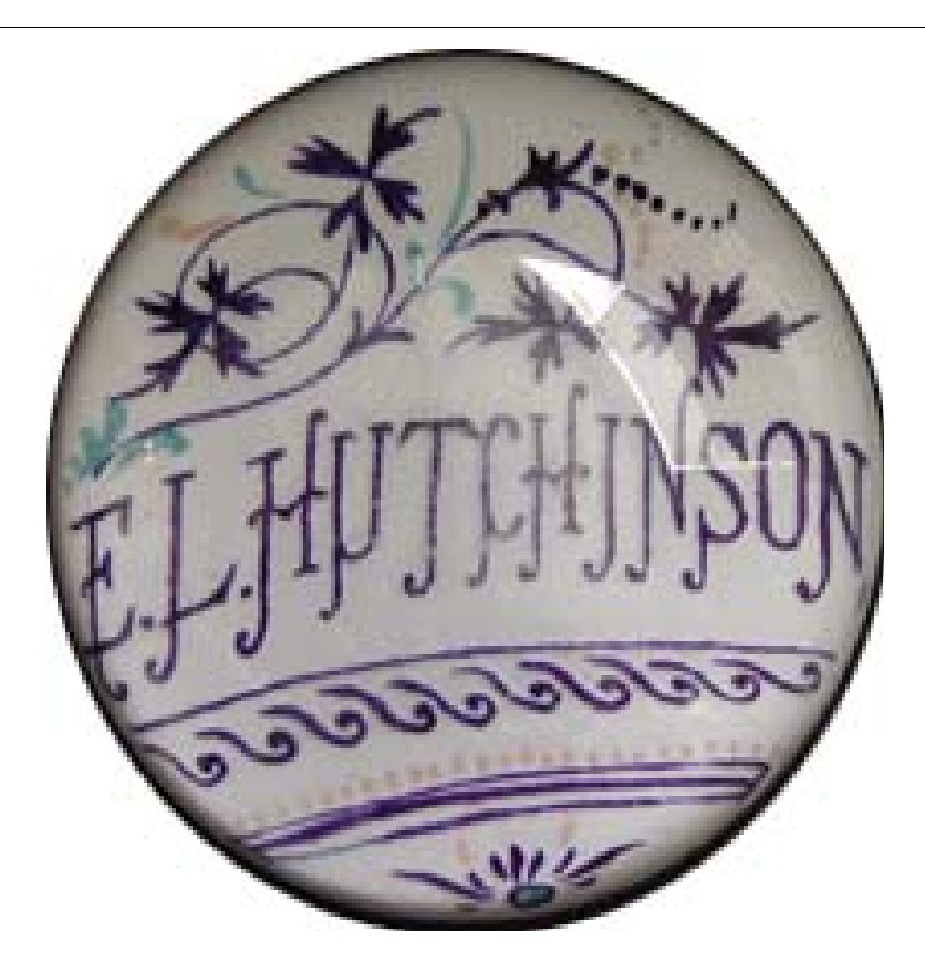
Figure 1. Hutchinson Personalized Paperweight