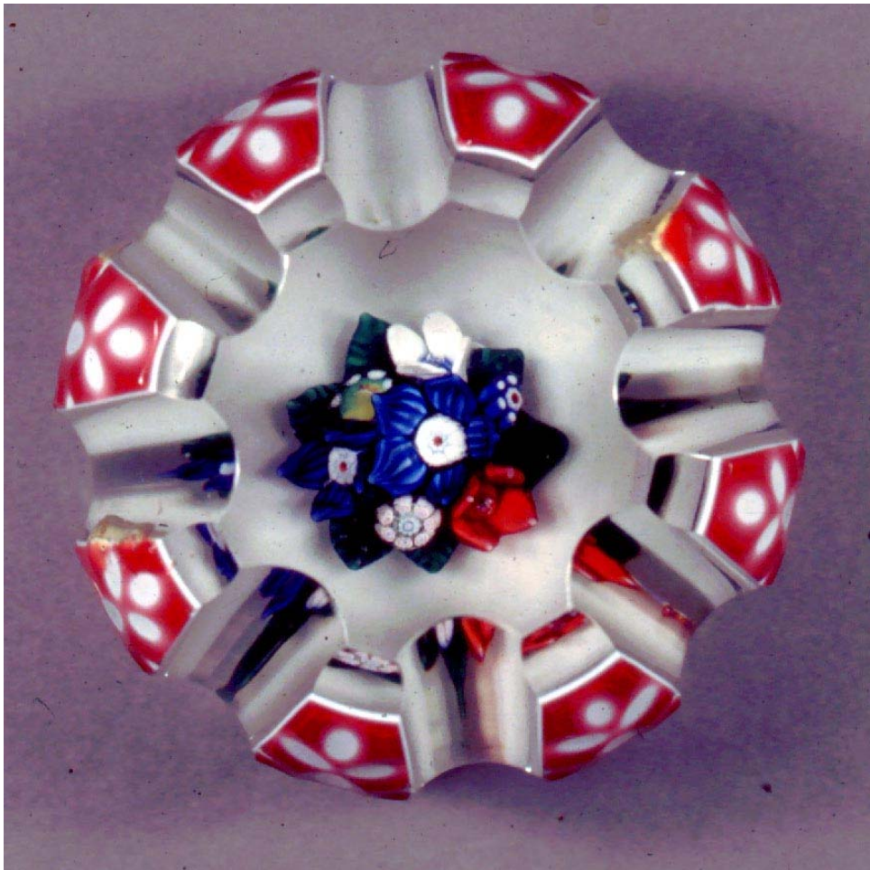
Figure 8. NEGC Double Overlay [N-YHS]