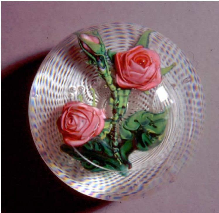
Figure 7. NEGC Two-Rose Bouquet