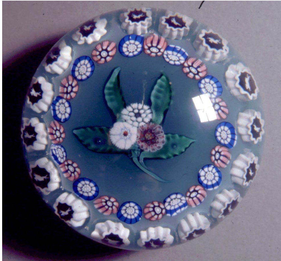
Figure 3. NEGC Posy on Aqua Ground