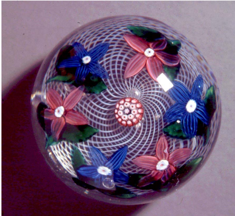
Figure 5. NEGC Garland