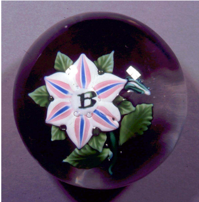
Figure 9. Boston and Sandwich Flower with “B” Cane