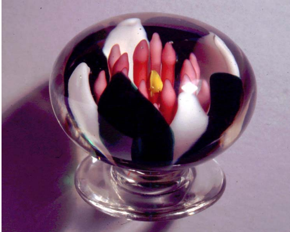
Figure 10. Millville Lily [N-YHS]