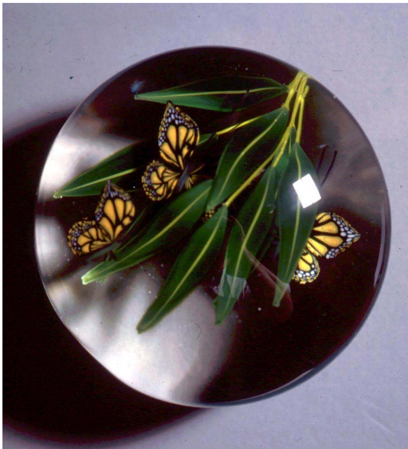
Figure 11. Steve Lundberg's Monarch Butterflies