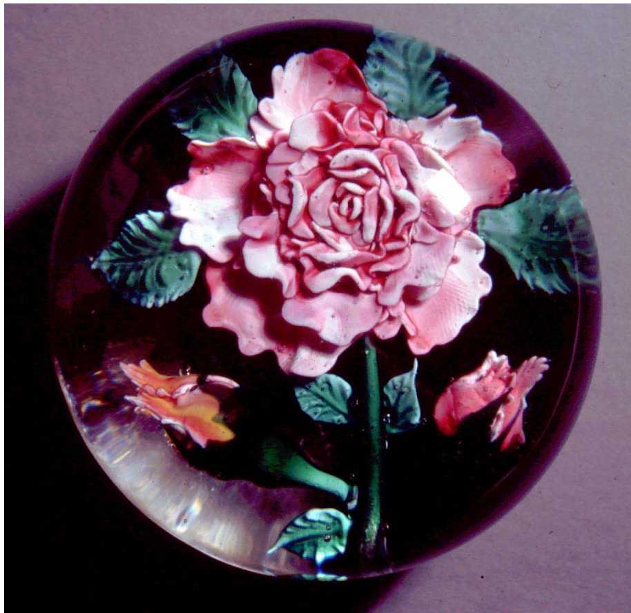
Figure 14. Mount Washington Rose