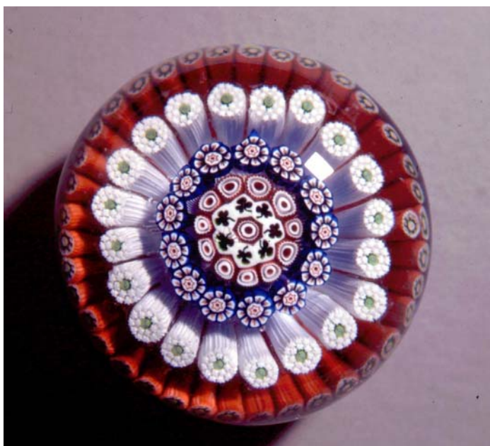
Figure 12. Baccarat Millefiori