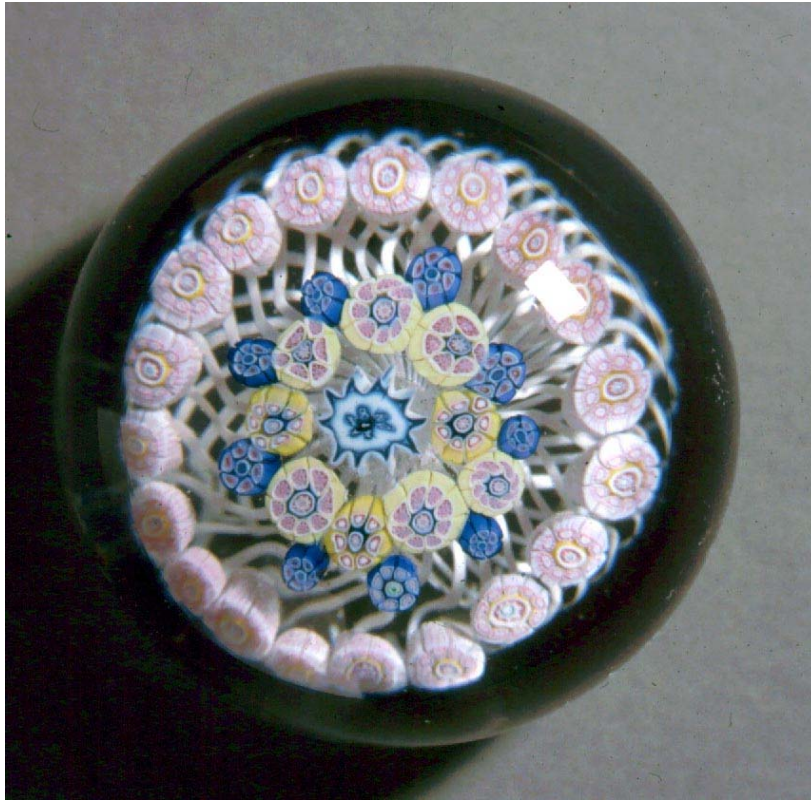
Figure 1. NEGC Open Concentric