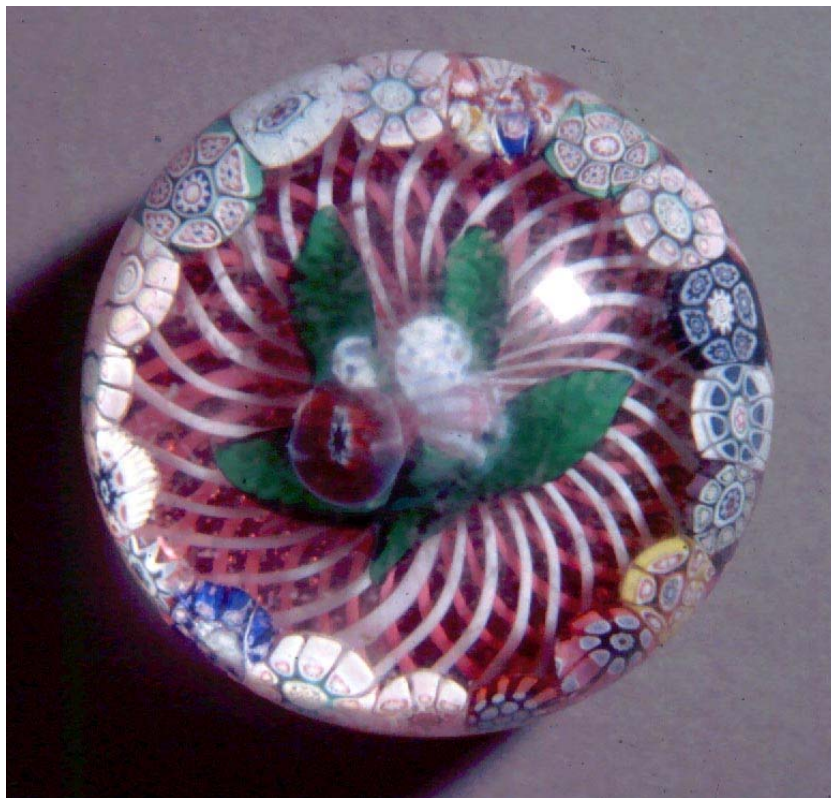
Figure 2. NECG Posy