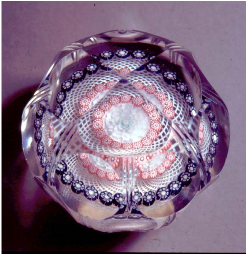
Figure 6. NEGC Pom-Pom